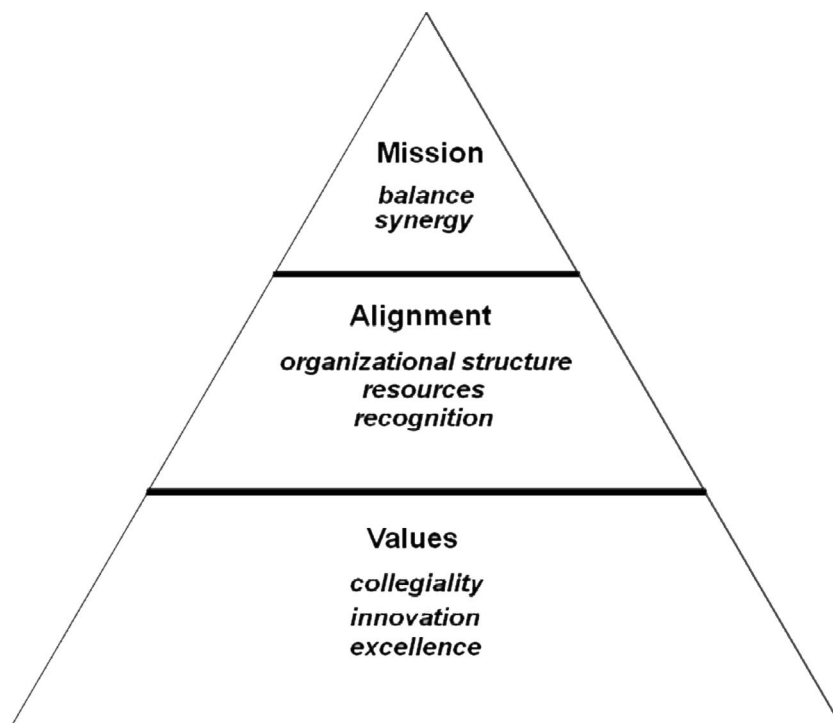
Figure 2 Ohio State University Medical Center (OSUMC) vision for the future. This graphic was first introduced by the OSUMC senior vice president in his January 2001 State of the Medical Center address and was used subsequently in the next five annual addresses to articulate clear expectations for OSUMC. The important association of mission, vision, and values with organizational performance has been well examined.

The value of this new leadership team was significant, especially because seven of the members were already highly trusted, respected members of the OSUMC community. Their counsel provided the senior VP an excellent means to learn and understand issues, challenges, and opportunities and helped him communicate more effectively with faculty and staff. The eighth member (the COO/CFO) was a highly respected community business leader and the sitting chair of the board of the affiliated Columbus Children's Hospital. This appointment helped the leadership team